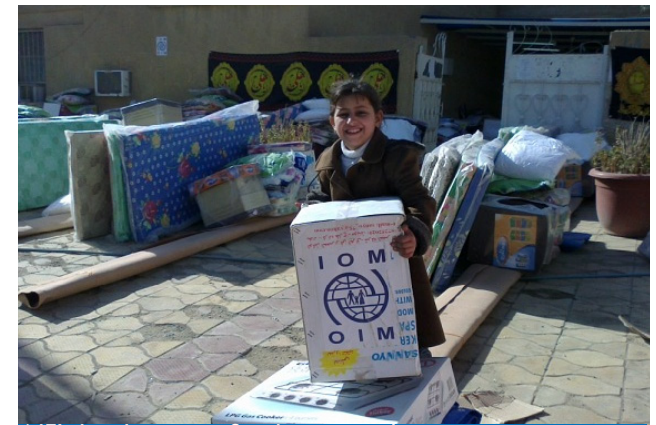
NFI distribution to families in need