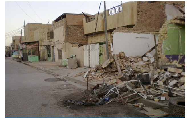
IOM responded immediately to the bomb attack

IOM recently replaced 75 square meters of glass in Al Nahrain Secondary School, which was damaged by a bomb attack on December 22nd, 2011. IOM's Emergency Response Team is also currently in the field, distributing 75 NFI kits to families affected by a car bombing in the Zaafaraniya district of Baghdad.