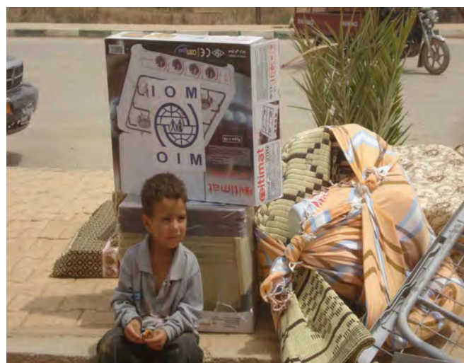
A child affected by storms in Kerbala receives IOM assistance