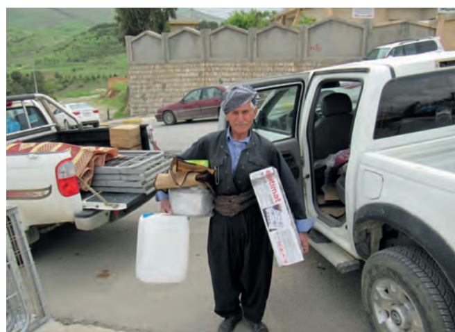
Resident of Warte receives his relief items