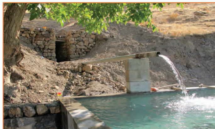
A karez following IOM restoration

For further information on the Mines Advisory Group (MAG), please visit: www.maginternational.org