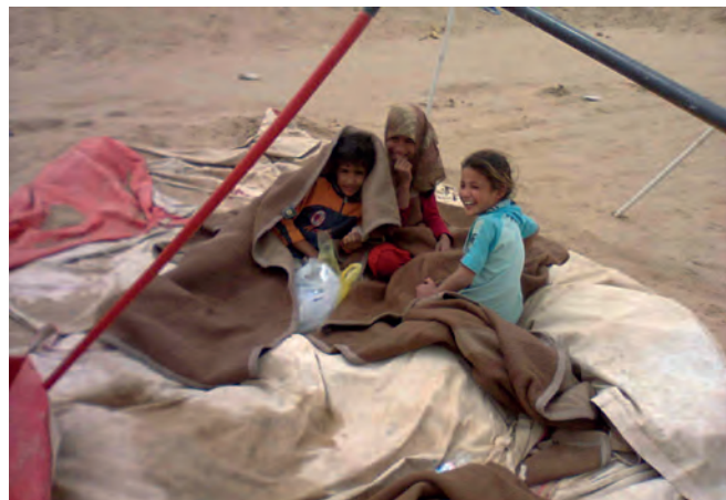
Many of the families lost their homes and possessions

With funding generously provided by USAID's Office of Foreign Disaster Assistance (OFDA), IOM Iraq remains poised to assist those in greatest need as a result of natural disasters such as sudden flooding.