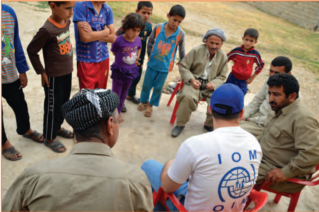
An IOM monitoring visit to Bajilla Sarkavruk village in Ninewa